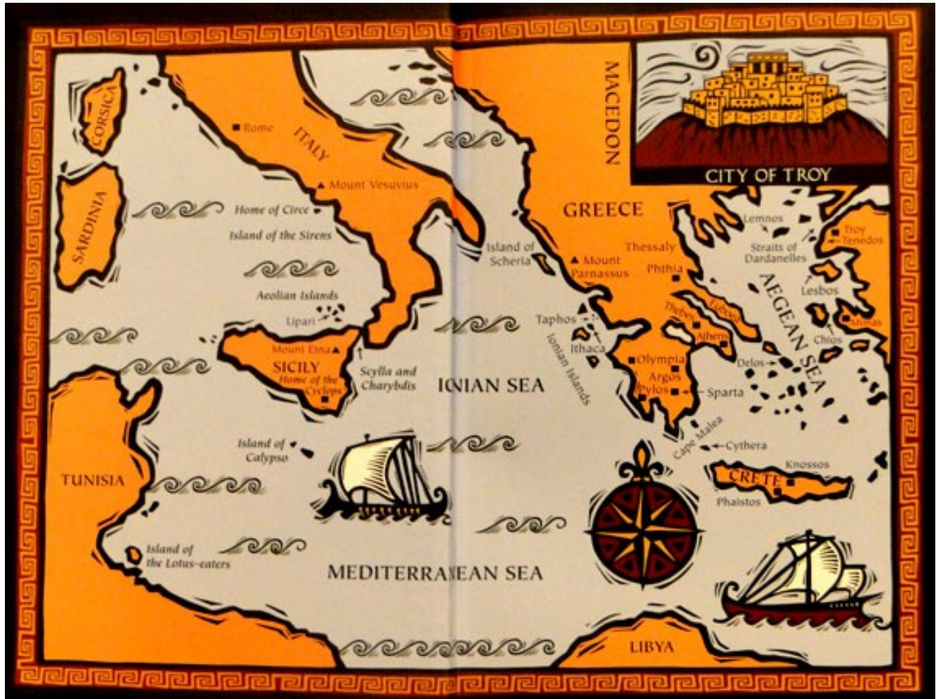
Map of Greece and the City of Troy

There is a debate that has been occurring for years between liberals and African nations about whether the practice of homosexuality is unAfrican. This next segment will take a detailed look at this practice and its origins.