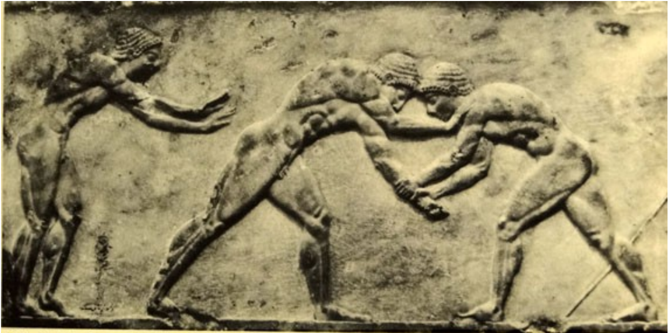
4.12 Wrestlers, from a statue base, c. 500 bc. Marble, 12½ins (31.8cm) high. National Archeological Museum, Athens.

However, despite claims that Africans also used to engage in this practice, that is considered unnatural around the continent—not a single advocate for the homosexual lifestyle has been able to provide evidence of artwork in any African culture, ancient or modern, that celebrates this lifestyle.