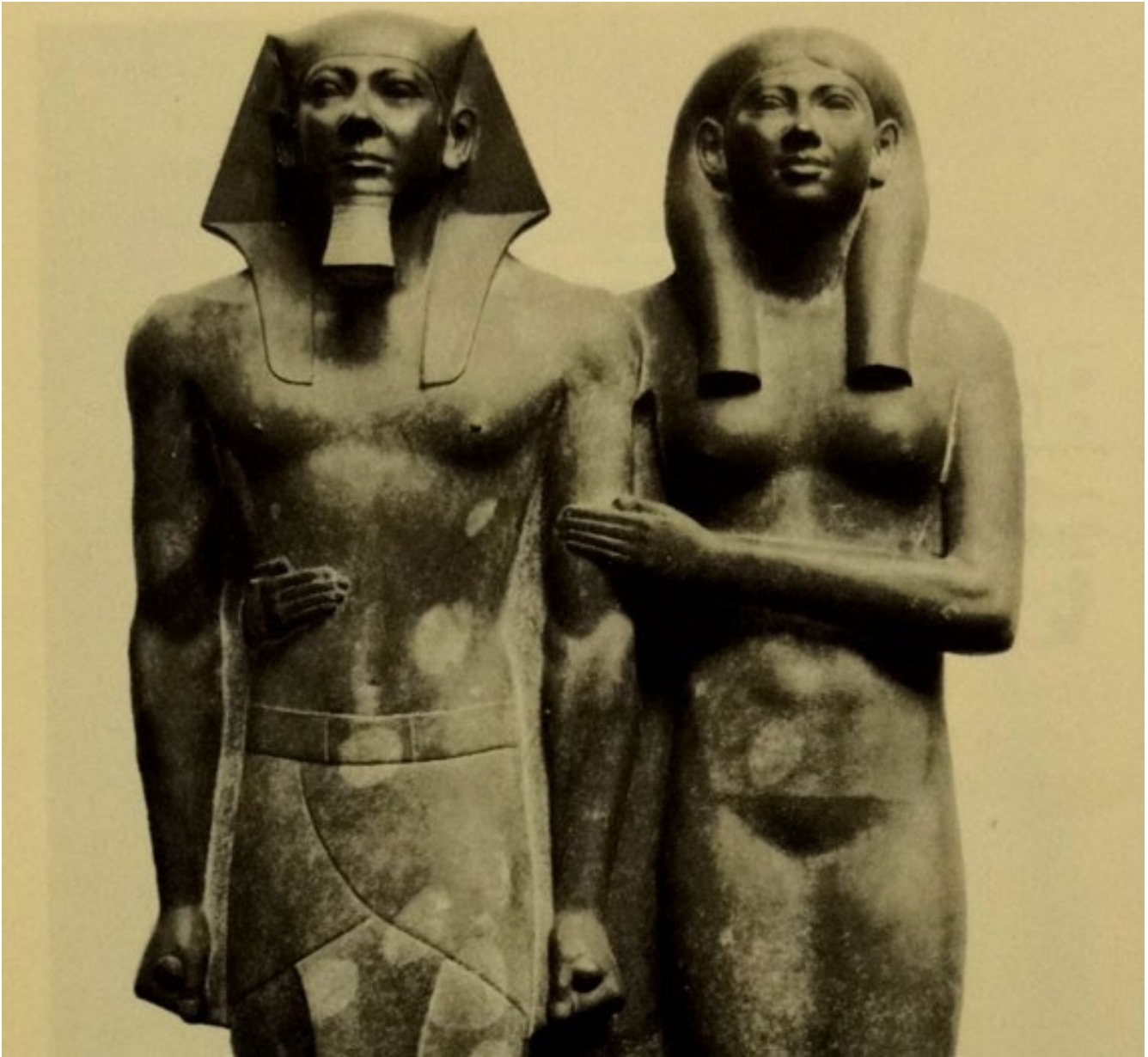
King Menkaura and his queen from Giza, 2600 B.C.

When Brutus was brought before the Roman Forum and asked why he rose against Caesar his answer was: "It's not that I loved Caesar less, but that I loved Rome more." —Shakespeare, Julius Caesar Act III scene II.