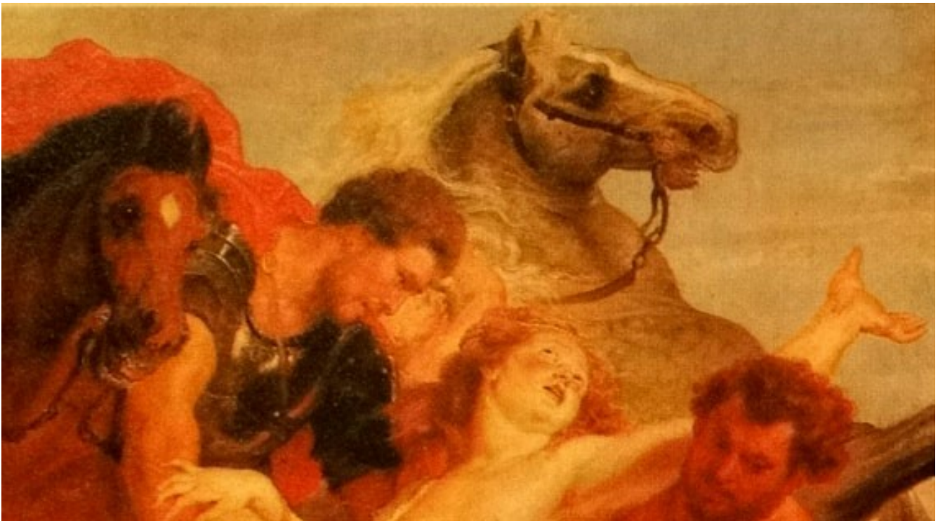
Painting by Peter Paul Rubens of the Rape of the daughters of Leucippus . The painting has been cropped out for obvious reasons, but is one the most celebrated paintings around the world. Rubens is known for painting his subjects as full-figured women, from where we derive the term "Rubenesque" to refer to a big woman .

The Greeks and Romans continued to practice homosexuality, but they also showed a raw passion for women, unlike the era before the Hellenistic period. Yet even up until the High Renaissance, women were depicted in both paintings and sculpture engaged in violent sex scenes. Some of the most celebrated paintings and statues in Europe are those of women being raped like the Rape of Proserpina by Berinini, the Rape of Sabine's daughters by Giovanni Bologna, Bernini's Daphne and Apollo (in which Apollo is pursuing Daphne to rape her, then she turns into a laurel tree) and the Rape of the daughters of Leucippus by Flemish painter Rubens as shown below: