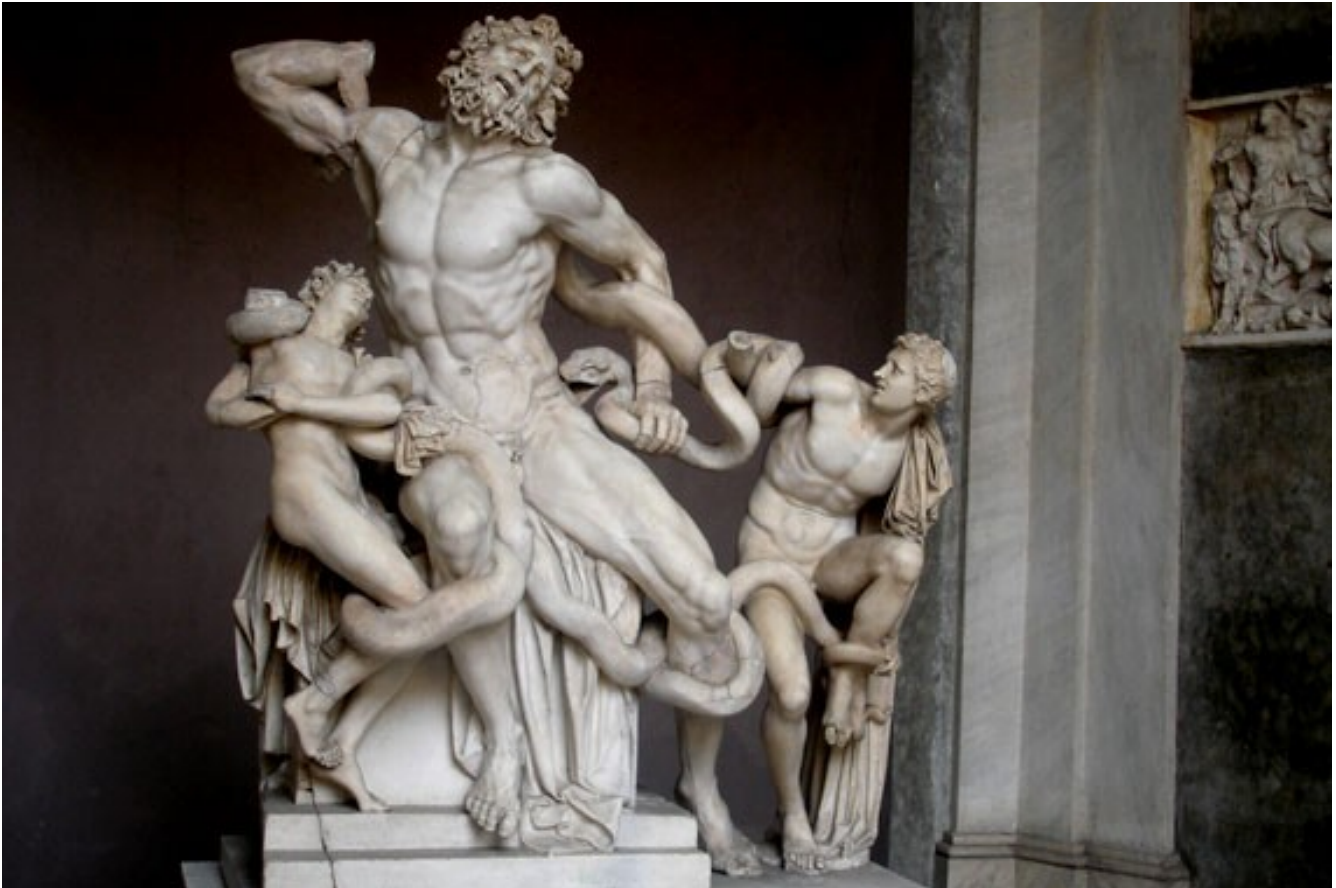
Laocoon and his two sons (200-70 B.C.) The legend of this Greek sculpture is that while Laocoon and his two sons were making an offering, a serpent came out of the sea and consumed them. The group shows adult and young nude males in perfect physical condition, with athletic bodies celebrated by the Greeks. — Photo by Joseph Earnest, the Vatican Museums, Vatican City.

While the Africans exalted their women in art and real life, the Europeans portrayed theirs as sex objects, and men were celebrated as perfect human specimens as shown in this ancient Greek statue of Laocoon and his two sons: